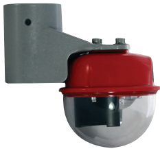
Sector Bridge Light

Sealite's SL-BRK is solar Bridge Lighting Kit specifically designed to clearly mark bridges and structures extending over navigable waterways, and is used extensively throughout the USA.