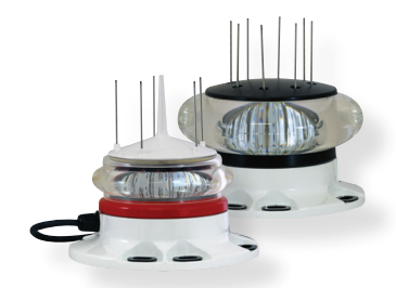
SL-155 Series bridge lights